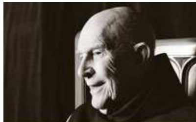
Father Keating at St. Benedict's Monastery

Centering Prayer is drawn from ancient prayer practices of the Christian contemplative heritage, notably St. John of the Cross and Teresa of Avila. Fr. Thomas Keating and Trappist monks developed this method of