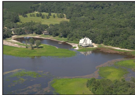
Aerial view of Camp Weed

In 1979 he was transferred to a daughter house, St. Benedict's Monastery in Snowmass, Colorado, where he served as Prior, vocation director, novice master, and teacher of theology and scripture. He spent 3 years in Israel where he studied scripture and taught at the Center for Biblical Studies in Jerusalem