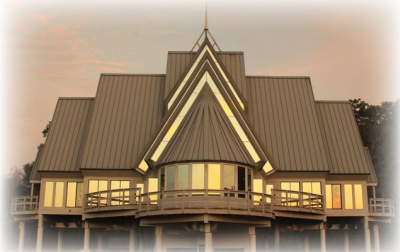
Beautiful and peaceful - Mandi's Chapel is the spiritual center at Camp Weed.